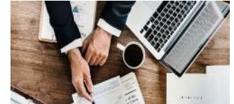
INNOVATION & INVESTMENT