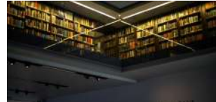
SCIENCE & EDUCATION FOR SOCIETY