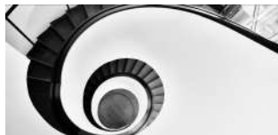
DESIGN & CREATIVITY