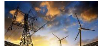
ENERGY & CLIMATE CHANGE