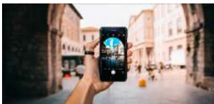
TOURISM & CULTURAL HERITAGE